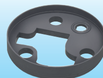
Optional Rubber Gasket SZ-200A